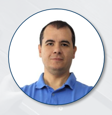
CEO & CTO